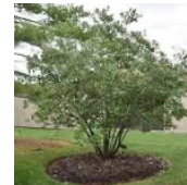
Sweet Bay Magnolia Tree/Shrub