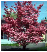
Red Twig Dogwood Tree