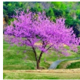
Eastern Red Bud Tree