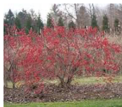
Winter Berry Shrub