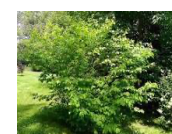
Spice Bush Shrub